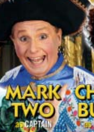
MARK TWO as CAPTAIN