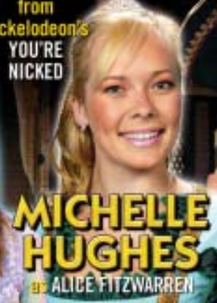
from Nickelodeon's YOU'RE NICKED