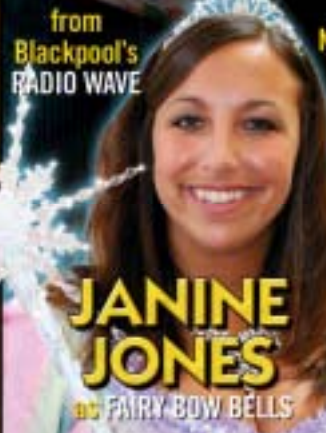
from Blackpool's RADIO WAVE