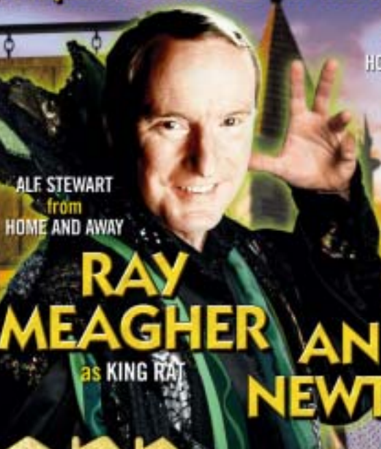
ALF STEWART from HOME AND AWAY